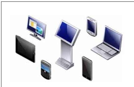
Content and Applications, Campus and Personal, Accessible on Any Device, Anytime, Anywhere